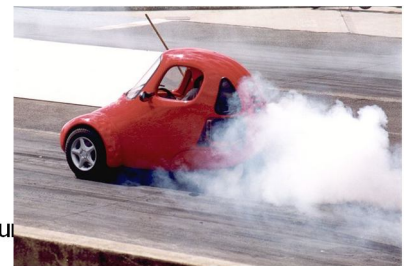
"The company was founded at the track"

For more information please go to http://www.alltraxinc.com Follow us on Facebook http://www.facebook.com/AlltraxInc