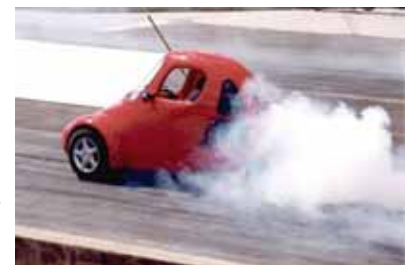
"The company was founded at the track"

For more information please go to http://www.alltraxinc.com