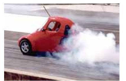
"The company was founded at the track"

For more information please go to <a href="http://www.alltraxinc.com">http://www.alltraxinc.com</a>