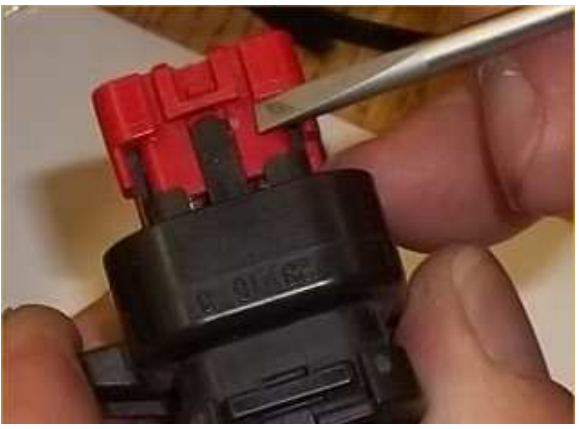
Pull the red cap upward \frac{1}{4} " – it will stop, this is the UNLOCKED POSITION